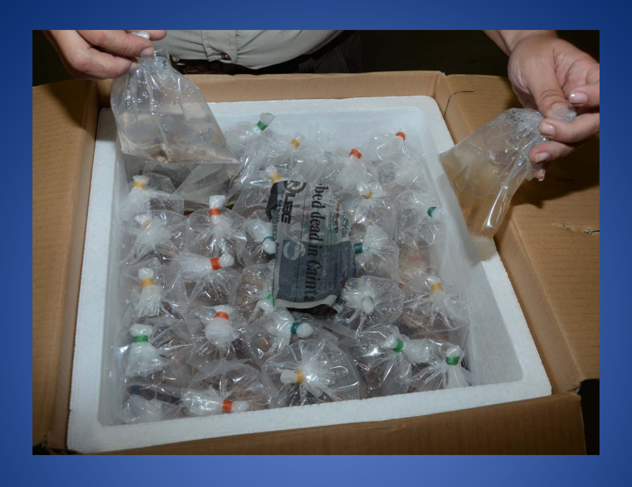
TYPICAL PACKAGING FOR LIVE FISH