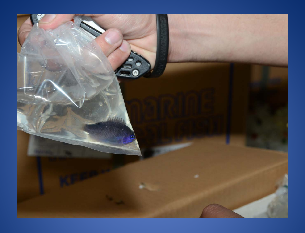
TYPICAL SHIPPING METHOD FOR LIVE FISH