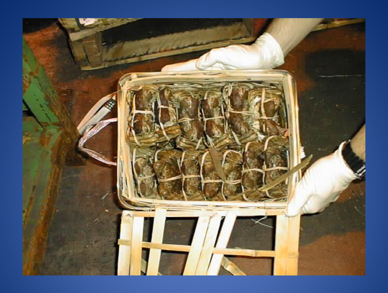
SHIPMENT OF LIVE MITTEN CRABS