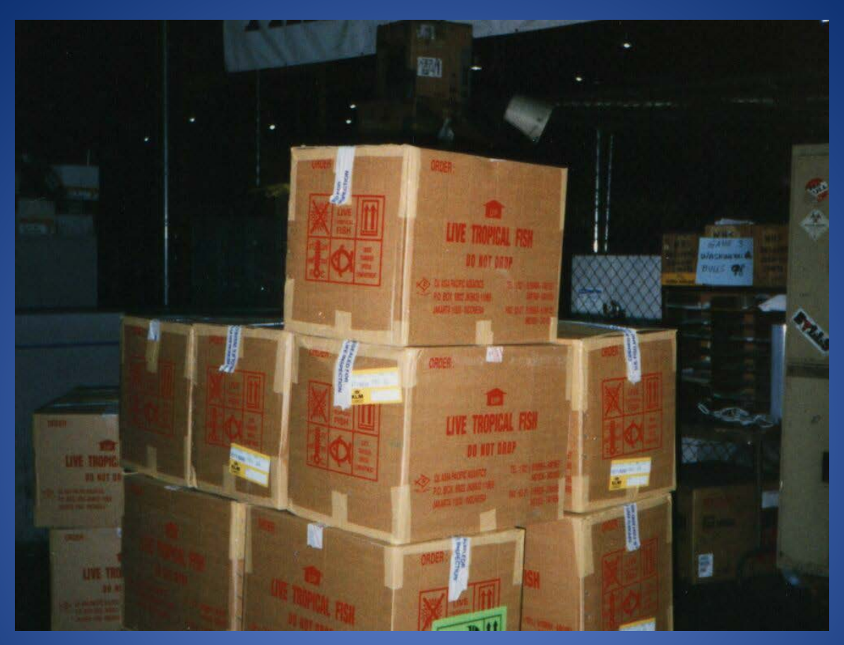
LIVE TROPICAL FISH SHIPMENT IN AIR CARGO WAREHOUSE