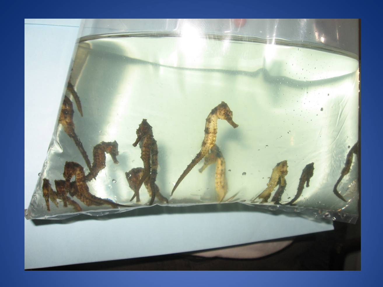
SHIPMENT OF LIVE SEAHORSES