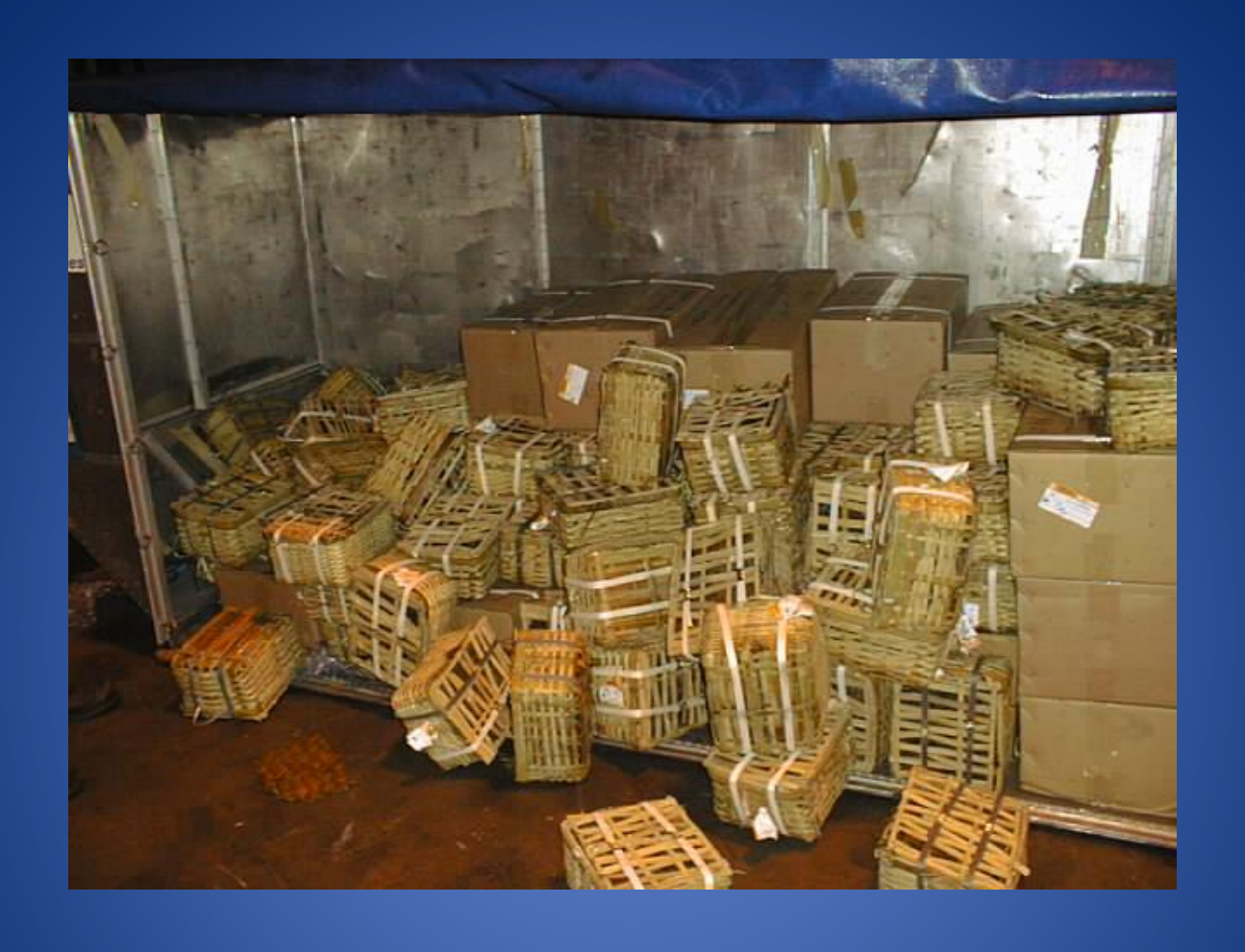
SHIPPING CONTAINER OF LIVE MITTEN CRABS