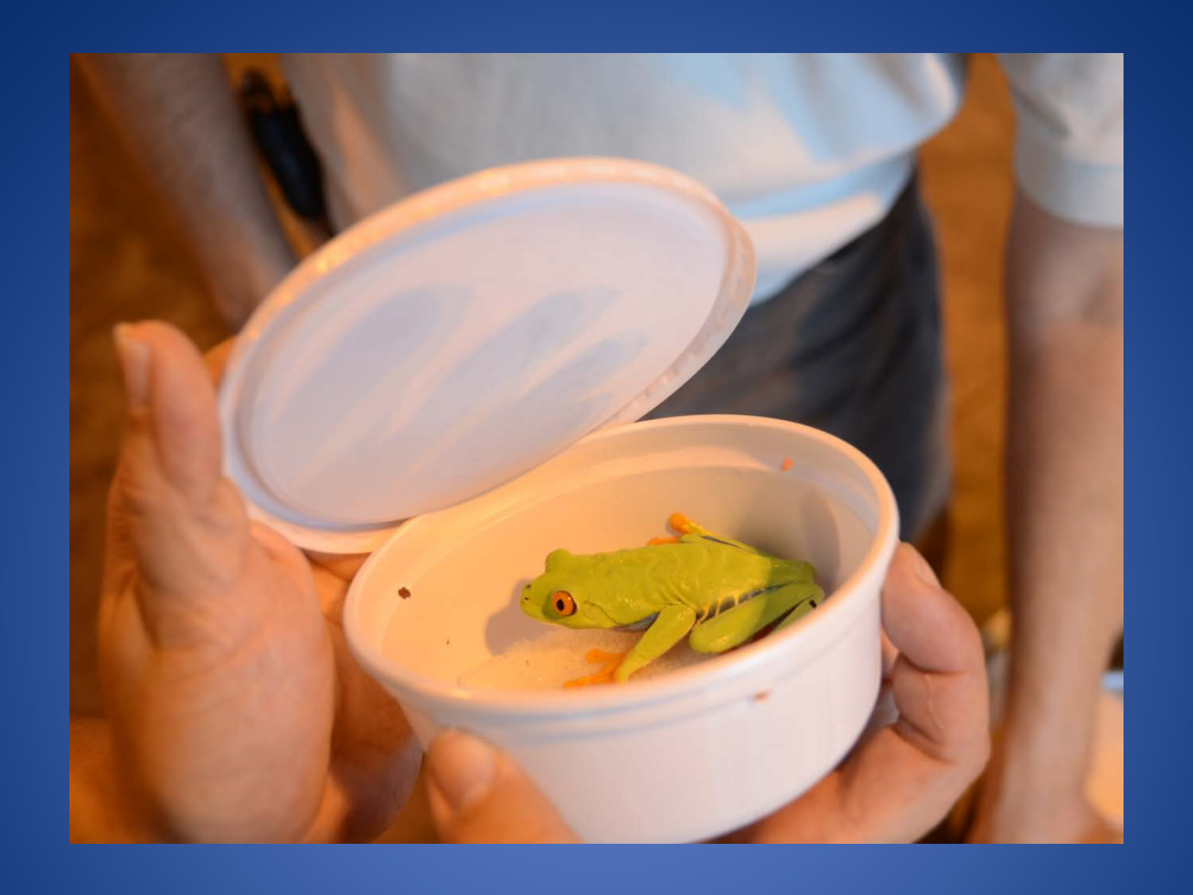
CLOWN TREE FROG