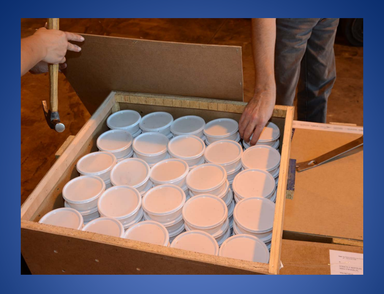
TYPICAL LIVE ANIMAL PACKAGING