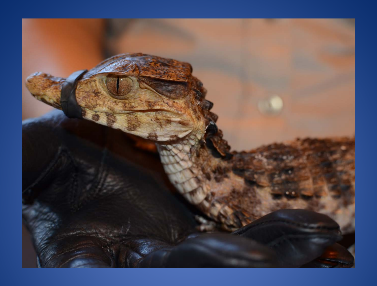
LIVE BROWN CAIMAN