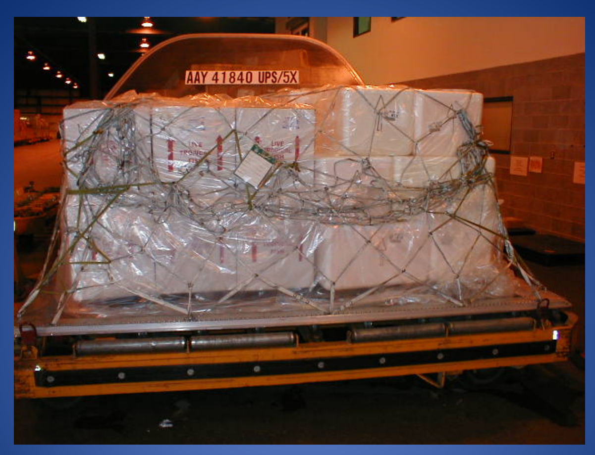
SHIPMENT OF LIVE TROPICAL FISH PRIOR TO INSPECTION